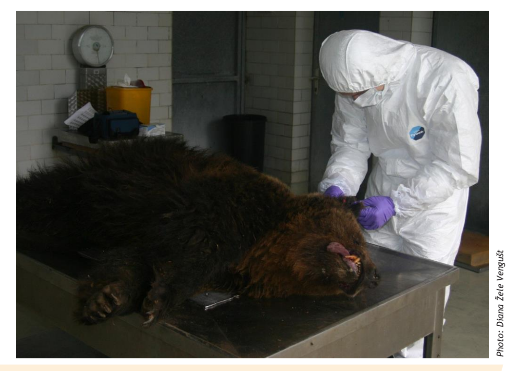
A forensic investigation of the carcass of an animal suspected of having been poached comprises multiple tests and measurements conducted by specially trained VF experts. The goal of the investigation is to determine the cause of the animal's death.