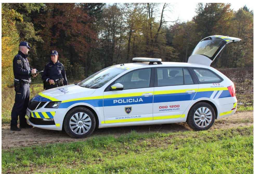
Fieldwork by a police patrol.

In connection with hunting or poaching, the police may investigate three criminal offences: game poaching (Article 342 of the Criminal code - KZ-1), fish poaching (Article 343 of the KZ-1), and the unlawful handling of protected animals and plants (Article 344 of the KZ-1). These instructions are applicable to the investigation of illegal actions associated with wildlife - game poaching (Article 342 of the KZ-1) and the unlawful handling of protected animals and plants (Article 344 of the KZ-1), which are criminal offences committed with intent that may be perpetrated by anyone and are prosecuted ex officio.