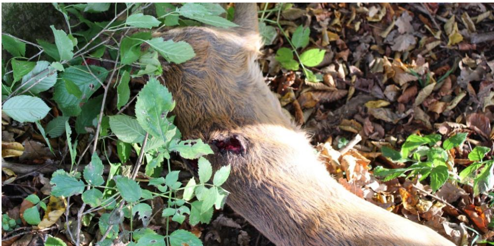
Reporting a suspected poaching incident; gunshot wound on a roe deer carcass.