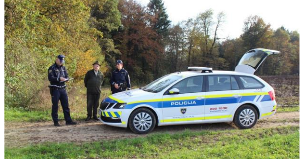
Making a report on the police investigation of the crime scene and an official preliminary record of the event.