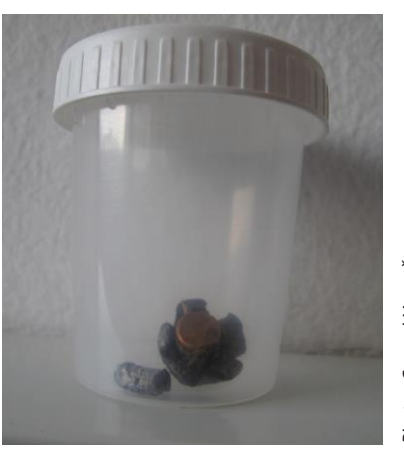
Various measurements can also determine the bullet's trajectory in the body (left). When bullet fragments are lodged in the carcass they are collected and submitted for ballistic analysis (right).