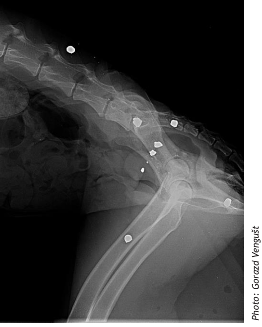
An x-ray is the first in a series of tests that the VF performs when poaching is suspected. The method makes it possible to quickly detect bullet fragments in tissue (left), including fragments not visible to the naked eye. An x-ray image helps determine the location, size, and sometimes type of fragment (right).

IDENTIFICATION AND MORPHOLOGICAL TESTS of collected materials, animals, and carcasses, which includes macroscopic and microscopic tests and/or genetic testing methods.