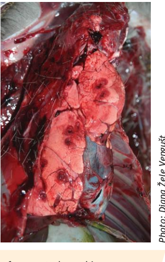
Gunshot wounds are the most common type of injury found in cases of suspected poaching. An injury may be clearly visible on the surface of the skin (left). Much more commonly, significant wounds and bleeding are found in the hypodermis (middle) or internal organs (right). Skin is elastic and fragments of bullets often remain lodged in skin tissue, which is why it is important to not tamper with the carcass, to move it as little as possible, and to protect it before it is transported to a testing facility.