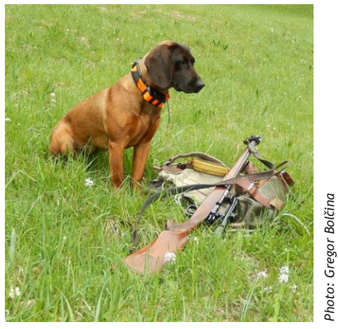
Participation of a tracking dog handler in a poaching investigation.